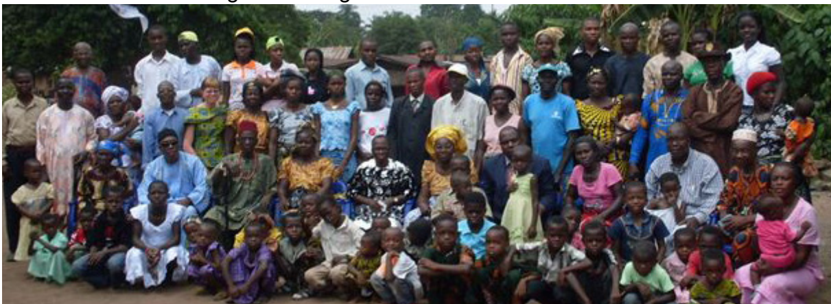
Agwa Convention Attendees