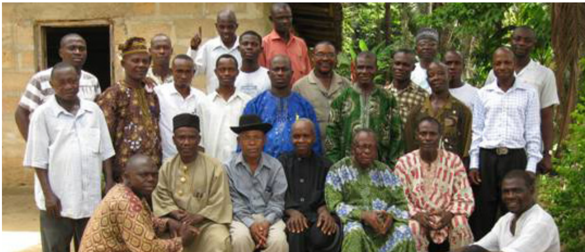
5th Nigerian Elders' Seminar Attendees