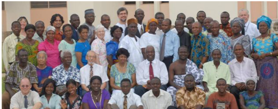
January 2010 Ghanaian/Nigerian Seminar Attendees