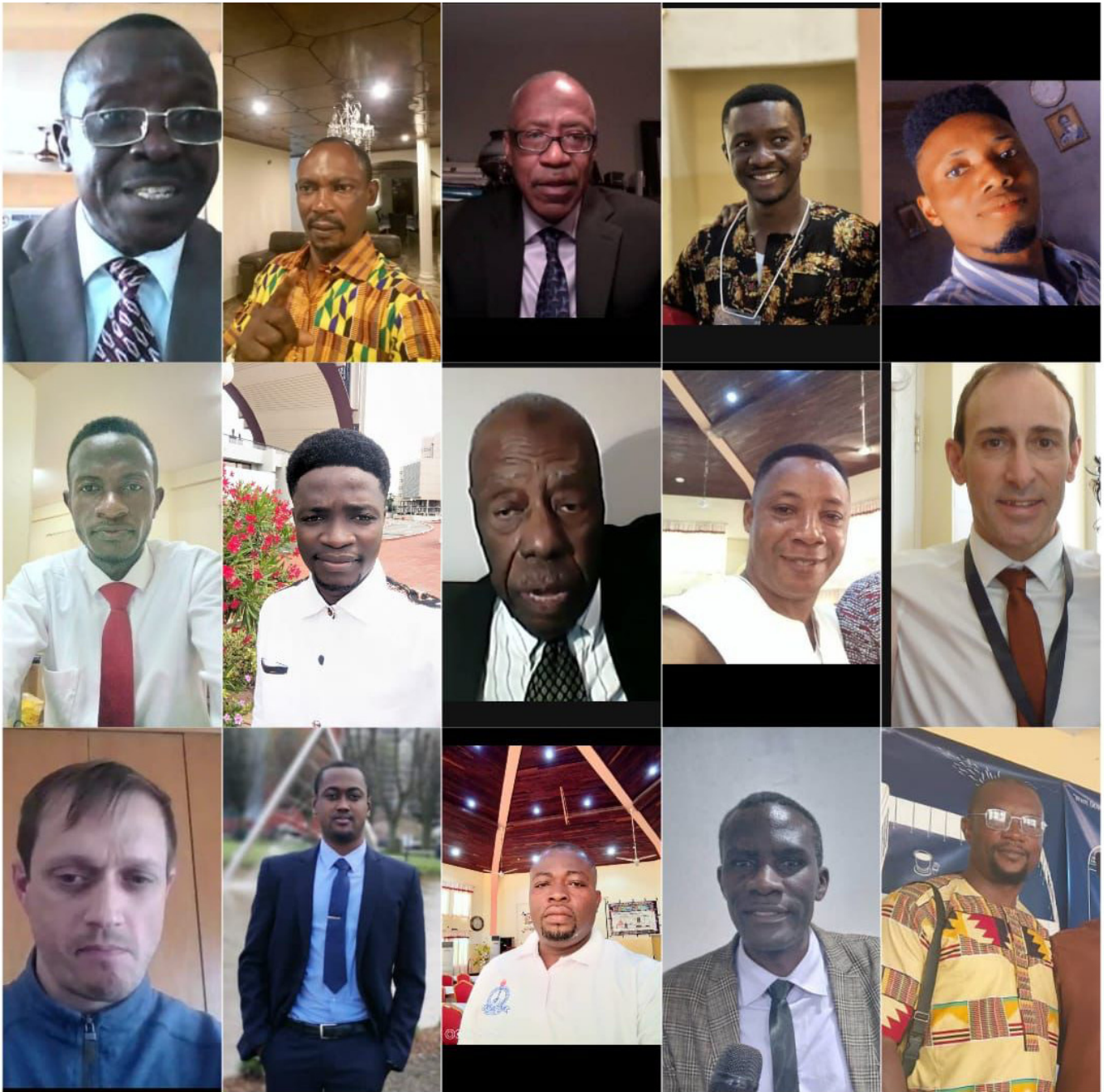
Servants at Ghana Year End Convention