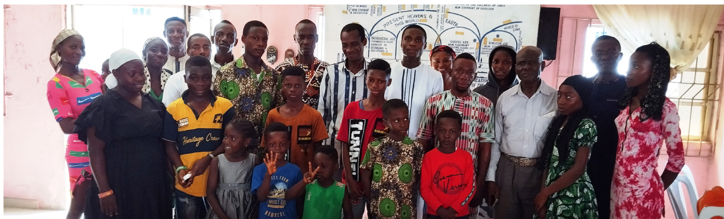
Ughelli Convention Attendees