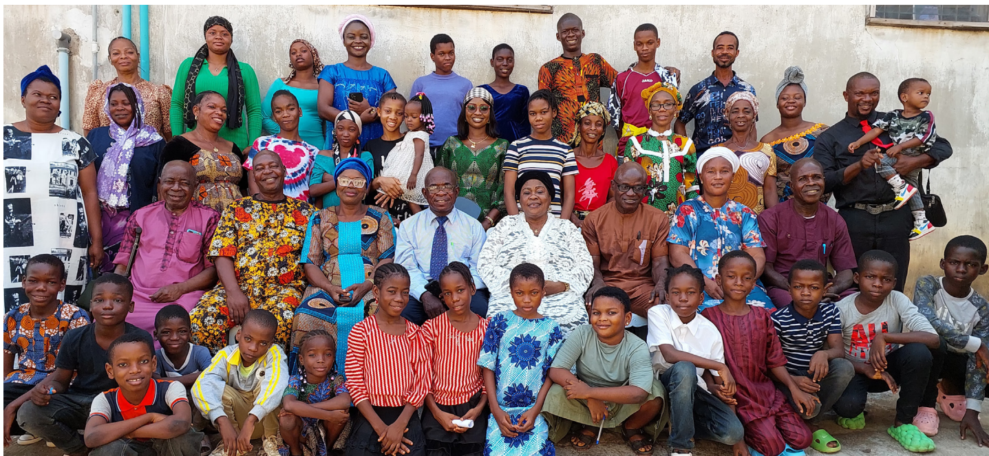
Ibadan Convention Attendees