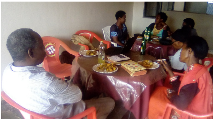
Brethren in Nyagatare Class Enjoying Lunch Break