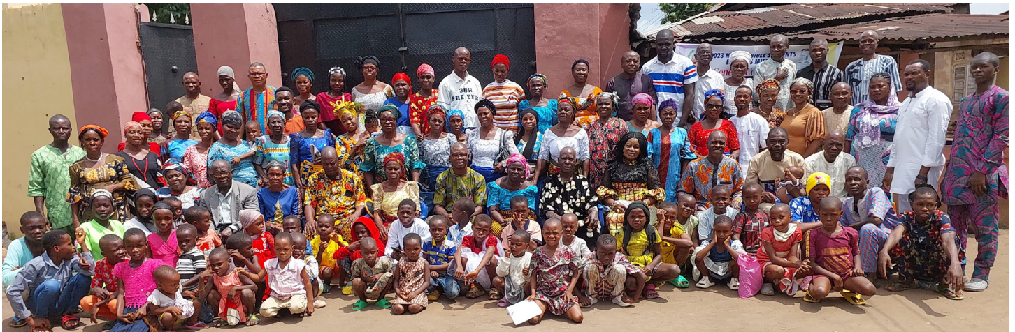
Group Photograph of Nigerian General Convention Attendees