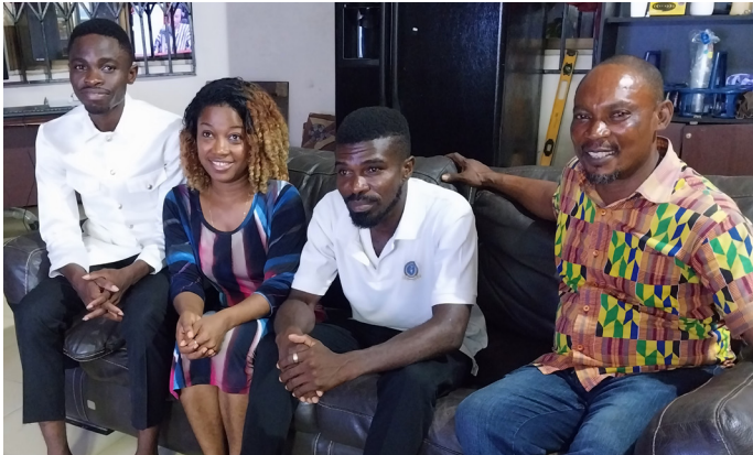
Report of Ghana Pilgrim Service Activities

we are seeing much seriousness in a few individuals and although they might desire to consecrate, we don't force any to do that when they are not ready. Nevertheless, we continue to pray for them. Lord willing, next month I will be in Cape Coast 2nd and 3rd December and in Dunkwa 8th to 10th December. Lord bless."