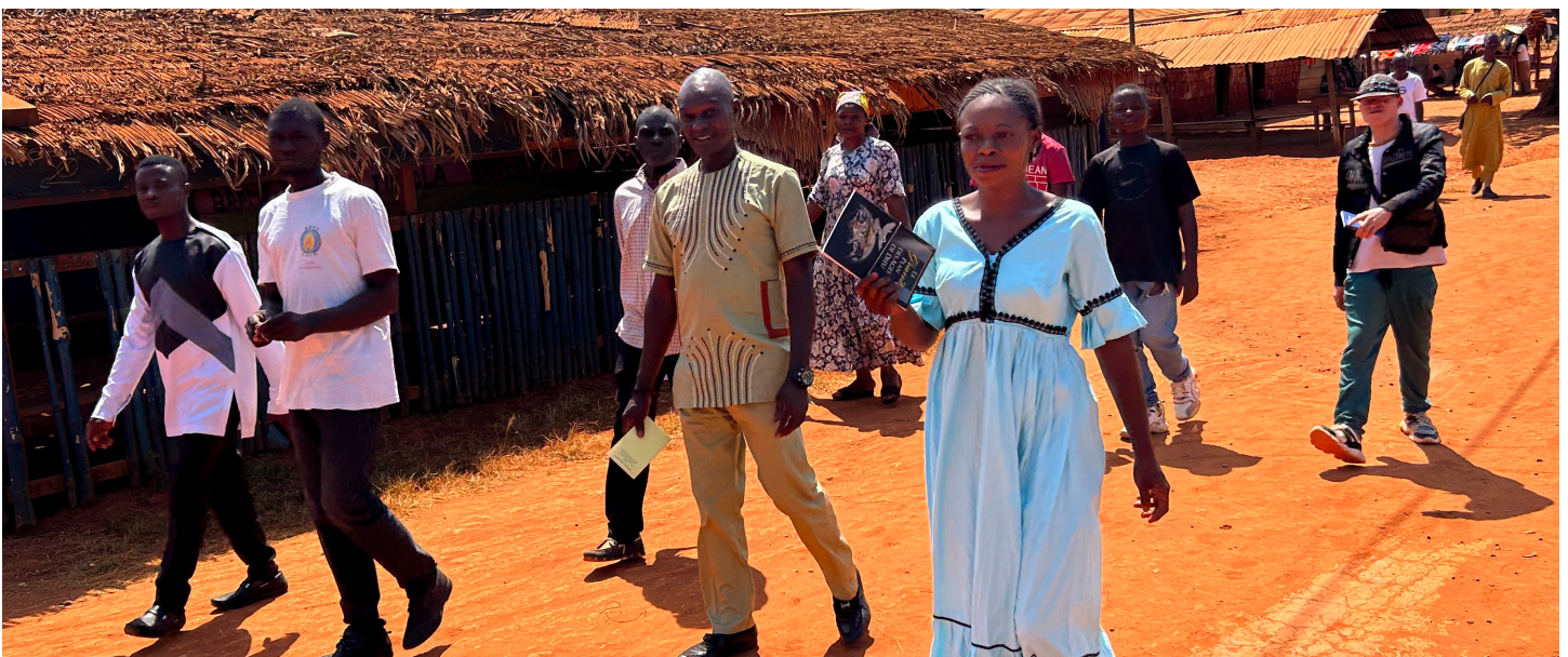
Witnessing in Paki