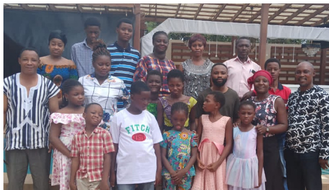
Attendees at Consecration Study in Accra