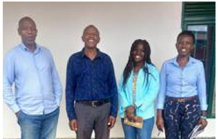
Studies with Nyagatare Brethren