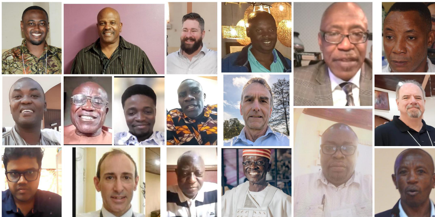
Servants at Ghana End of Year Convention

The 2024 Ghana End-of-Year Convention, held virtually on November 30, 2024, was a spiritually enriching event hosted by the Kumasi Bible Students Class. It centered on the theme: “Surely, goodness and mercy